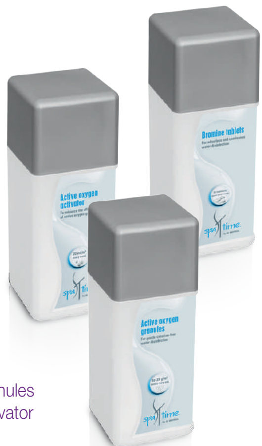
Bromine tablets Active oxygen granules Active oxygen activator

To increase the effectiveness of the granules, use them together with the Active oxygen activator .